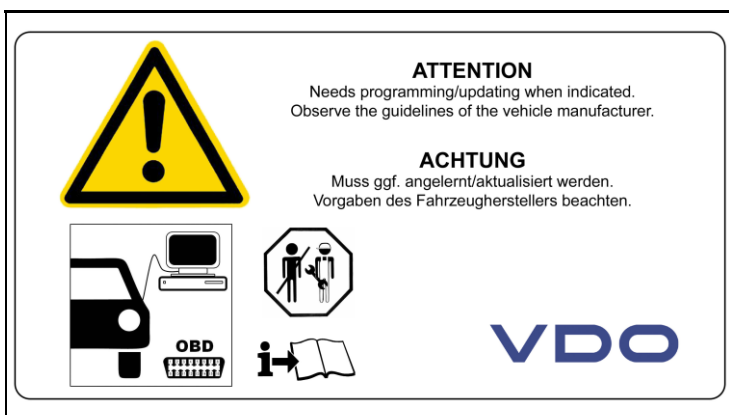
3 - Montage Hinweise / Installation Notes

Nennspannung (Positionssensor) / Nominal Voltage (Position Sensor) = 5 V