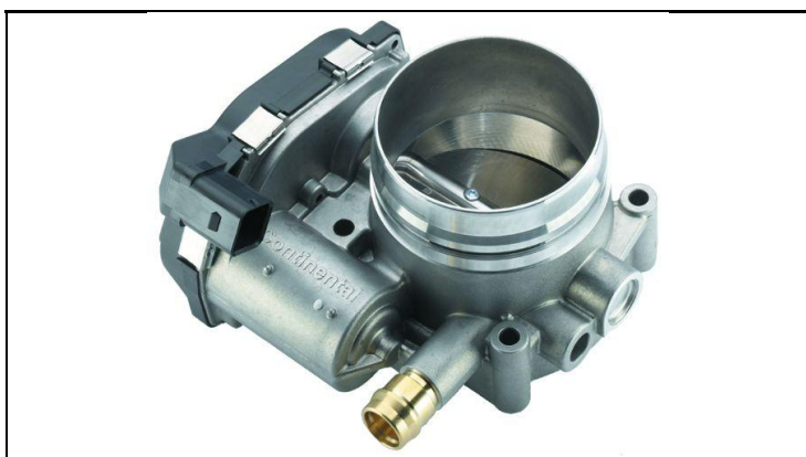
1 - Produkt / Product